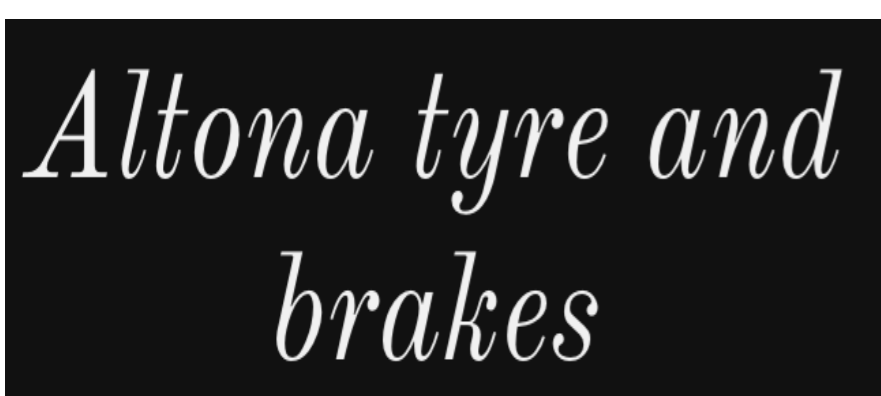
Sponsoring Lauren Trakosas