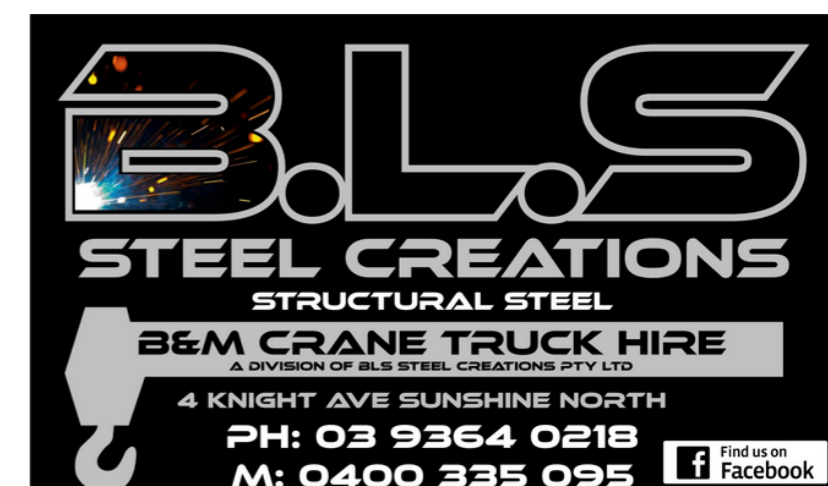
Sponsoring Abby Hildebrand