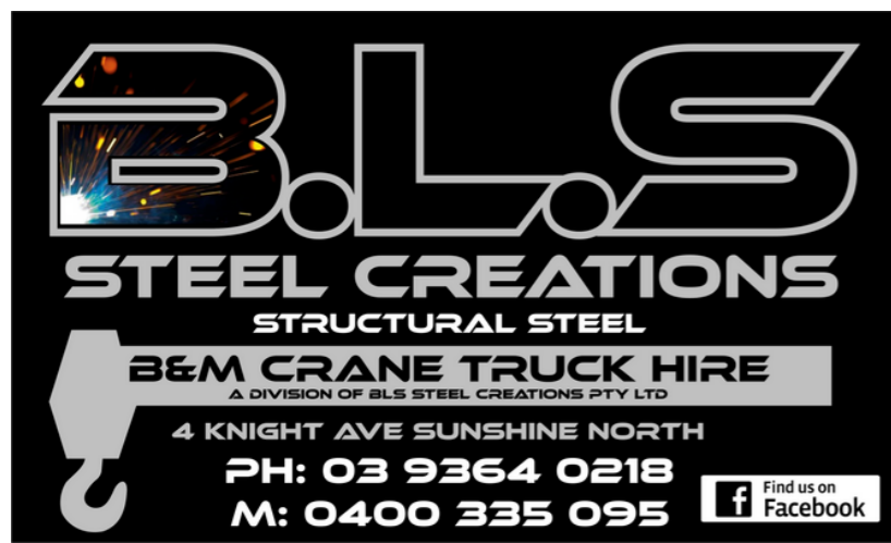
Sponsoring Chloe Hildebrand